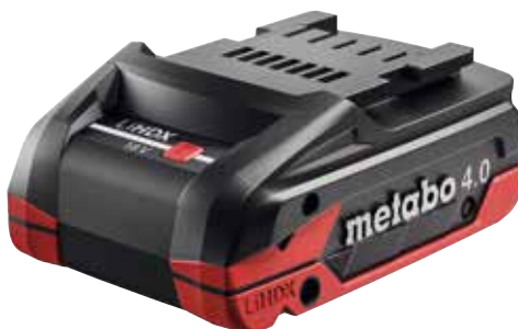
18V 4.0Ah LiHDX Battery Pack 6249740000 4.0 LiHDX