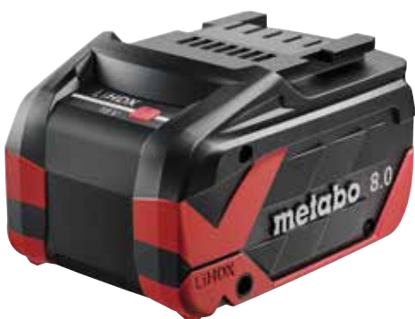
18V 8.0Ah LiHDX Battery Pack 624975000 8.0 LiHDX