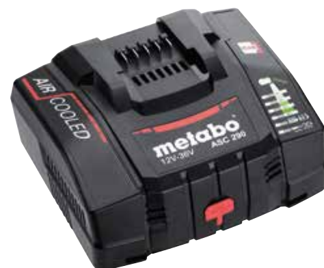
12-36V ASC 290 Air-Cooled Ultra-Fast Charger (16A) 627374000 ASC 290