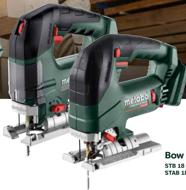
Bow Handle STB 18 LT 130 BL STAB 18 LTX 150 BL