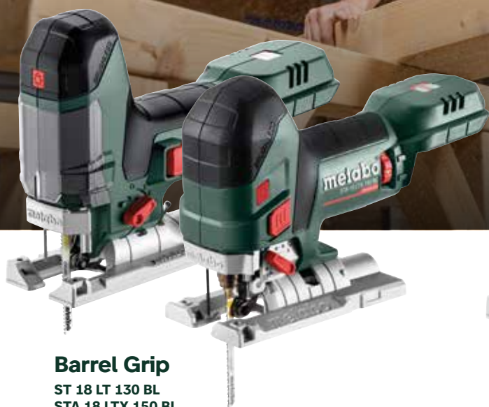
Barrel Grip ST 18 LT 130 BL STA 18 LTX 150 BL