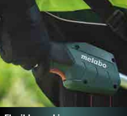
Metabo Quick thread change Fast and without tools, without removing or opening the spool.

Flexible working thanks to stepless speed control.